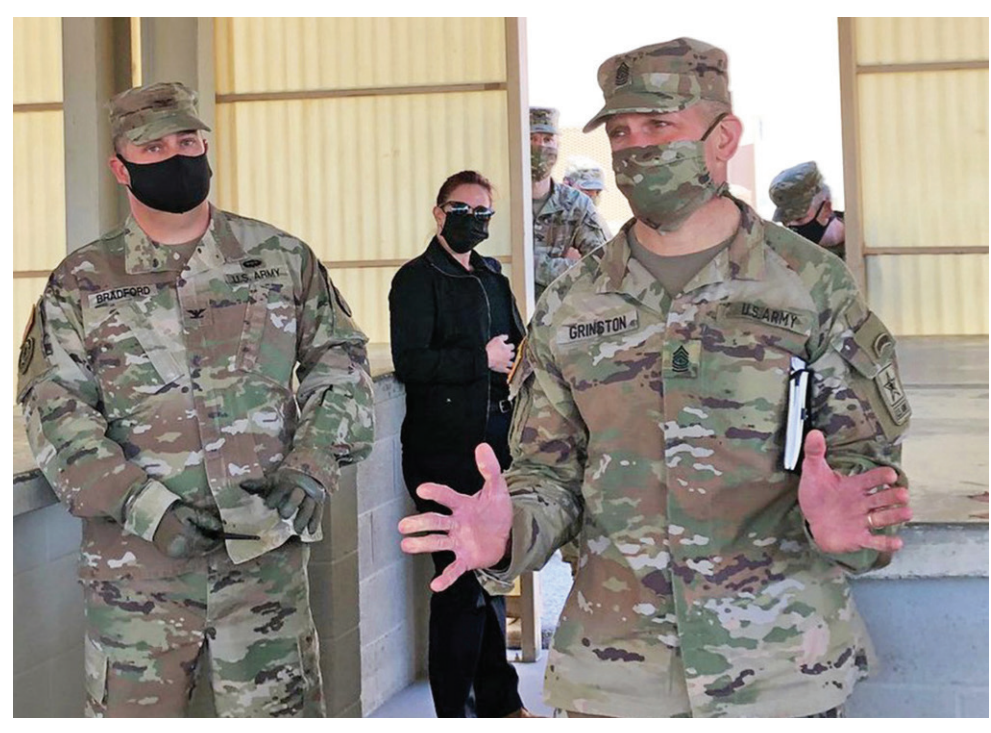
'We have an obligation as an Army to protect the nation, but in order to do that we also have to protect the force,' Sgt. Maj. of the Army Michael Grinston said.