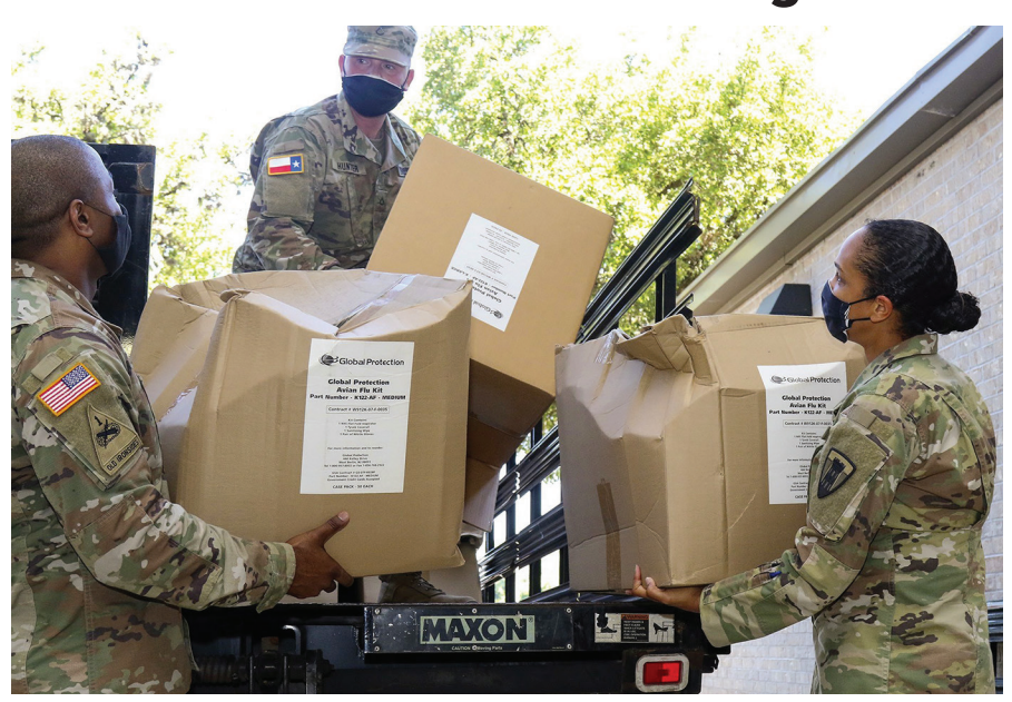
Army National Guard soldiers unload disinfecting kits in preparation to support long-term care facility operations at Camp Mabry in Austin, Texas.

he Association of the U.S. Army, along with the Air Force Association, is calling for senior leaders to extend National Guard deployments for troops mobilized in the fight against COVID-19.