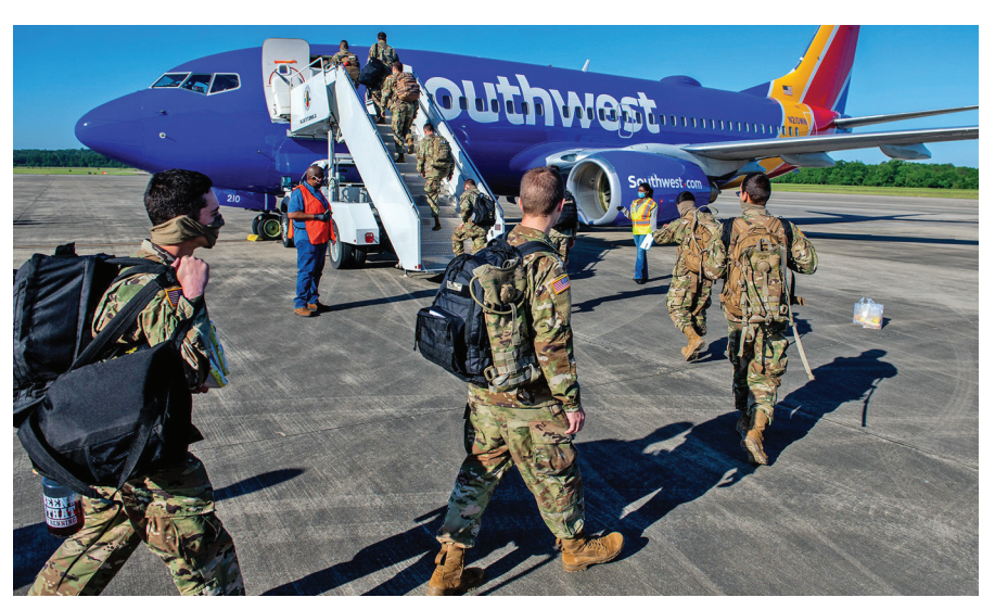
The May 22 memo signed by Defense Secretary Mark Esper allows commanders to implement a more tailored approach to travel based on local conditions.

In turn, service secretaries and combatant commanders will assess the conditions of each DoD installation, facility or location under their purview for the removal of local travel restrictions; the availability of essential services such as schools, child care and moving services; capacity at the medical treatment facility; testing capability; the capacity to isolate personnel returning from high expo-