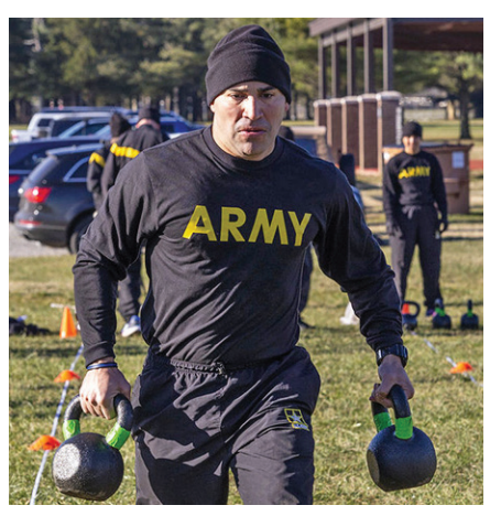
The Army has delayed implementation of the new Army Combat Fitness Test due to the pandemic.

The pandemic has also affected other parts of soldiers' lives.